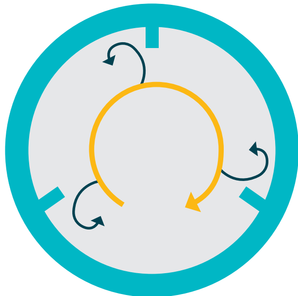
Effect of the baffles part (viewed from above)