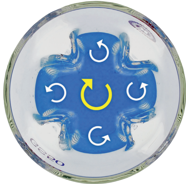
GS vessel principle (viewed from top)

Borosilicate glass is a chemical and temperature-resistant glass and shows an almost inert behaviour towards most of the chemicals (stable). The sterilizable screw caps with PTFE or a silicone seal are temperature-resistant up to 180°C. The stainless steel 18/10, which the vessels are made of, is rustproof, durable, has good insulating properties, completely hygienic, not toxic and not magnetic.